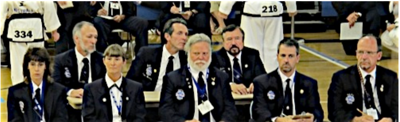
All those experienced officials, watching you....