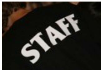
Hey, cut that out!