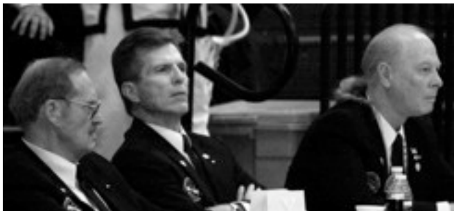
The Gup Levels can compete, too! But then, the Big Guns. Hey, how did he get that shot?